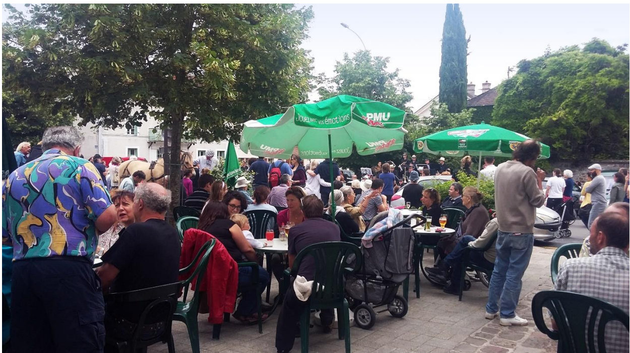
Chilling in Samoio village

The highlight of the year is always getting together for a long weekend with our French friends either in Samoio-sur-Seine or when the French visit us here in Harbury. Usually in May, the weekend includes entertaining at home, visits on the Saturday and Sunday to local places of interest, and a dinner with entertainment. Last year when the French visited us we celebrated Britain's Caribbean culture with a welcoming rum punch, the amazing Phase One Steel Band and a Caribbean dinner of marinated Jerk Chicken, Cajun roast lamb, and accompaniments, all washed down with wine supplied by Cana Imports. Trips out for this visit were to Coventry Cathedral and medieval Spon End on Saturday and a guided ramble and pub lunch on the Sunday – the French like our beer!