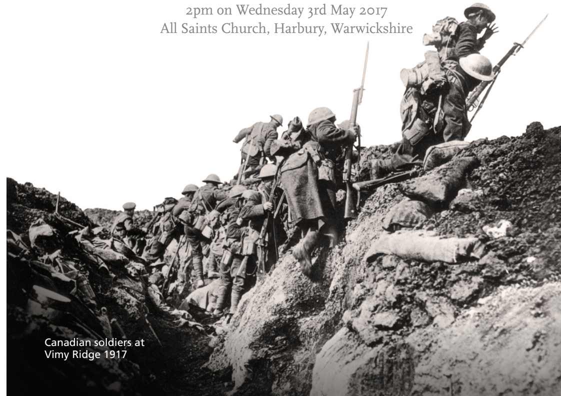
Canadian soldiers at Vimy Ridge 1917

2pm on Wednesday 3rd May 2017 All Saints Church, Harbury, Warwickshire