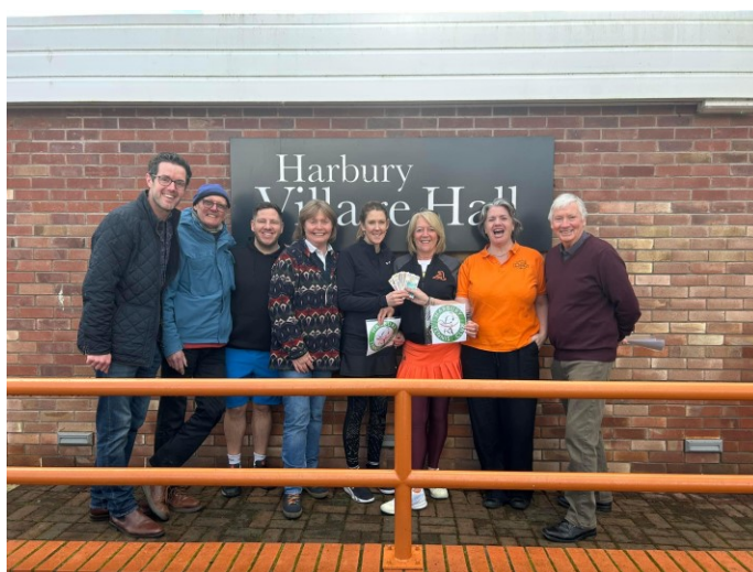
Members of Harbury Tennis Club receive £529 raised at the market